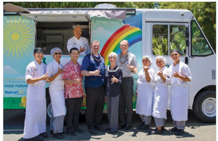
Kapi'olani CC's "Cooking up a Rainbow" Health and Wellness Food Truck makes healthy meals for O'ahu kids.

Throughout the year, the health and wellness food truck will provide cooking workshops,