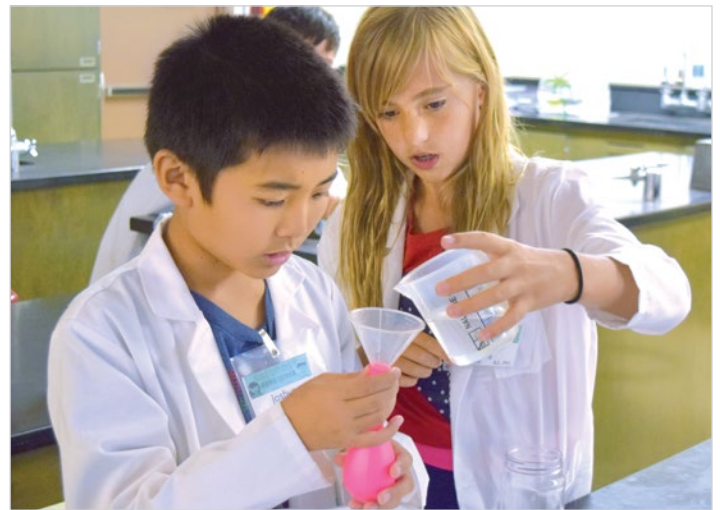
Saturday Gene-iuses at work in the lab at UH Mānoa.

To encourage greater participation by students in economically challenged neighborhoods, CTAHR