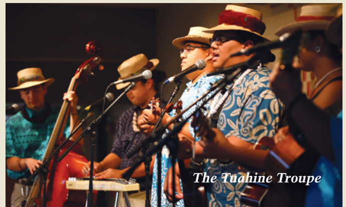
The Tuahine Troupe