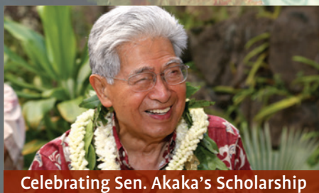
Celebrating Sen. Akaka's Scholarship