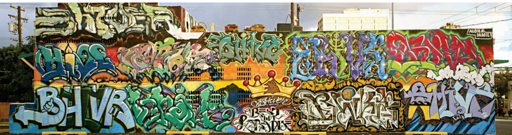
BHIVER tribute mural at Quintero's Mexican Restaurant in Honolulu.