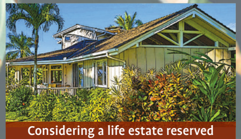
Considering a life estate reserved

FOR OUR UNIVERSITY, OUR HAWAI'I, OUR FUTURE