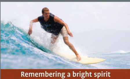
Remembering a bright spirit