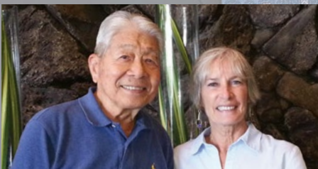
Helping UH faculty go global