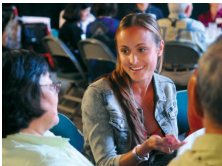
Students enjoyed talking with and thanking their benefactors.