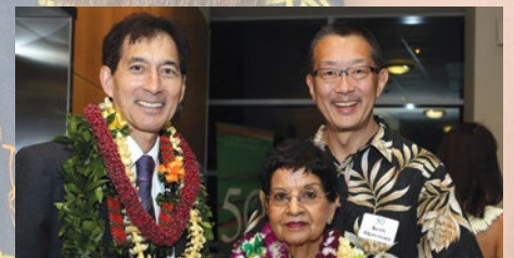
Celebrating JABSOM's 50th year

FOR OUR UNIVERSITY, OUR HAWAI'I, OUR FUTURE