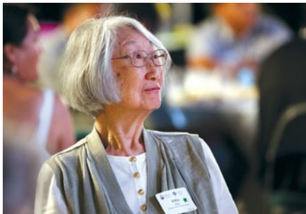
Guests marvelled over the beautiful video display on the lowered scoreboard at Stan Sheriff Center.