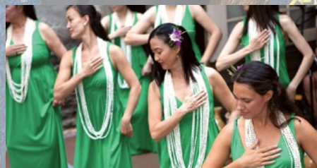
Preserving the Hawaiian language